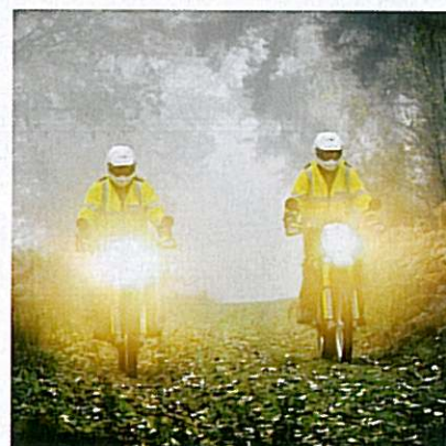
Getting revved up... Three constables from Mole Valley Safer Neighbourhood Teams in Surrey have raised funding to patrol their beats on off-road motorcycles for six months. The trio reckon the move, which is a first for Surrey Police, will help them tackle countryside crime in isolated areas that have been difficult to access either by car or foot, such as byways, bridleways and footpaths.